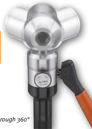
at 90° angle and rotatable through 360°